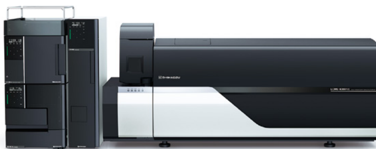
Liquid Chromatograph Mass Spectrometer LCMS-8060NX

In addition, using LabSolutions Insight™, which dramatically improves data analysis efficiency, and Peakintelligence™, which significantly reduces the difficulty of integrating the detected peaks, can optimize the output of data analysis tasks.